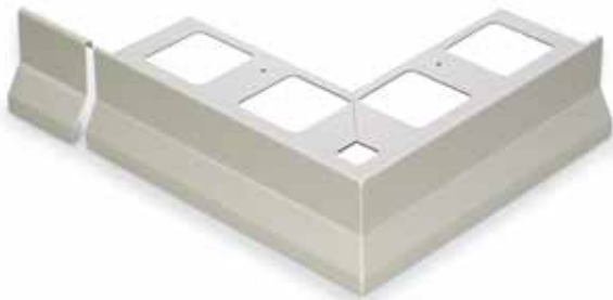
Example of external connection plus joining piece